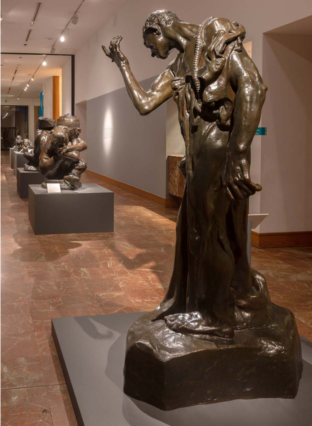
(near) ‘Pierre de Wissant, Vetu,’ (far) ‘Fallen Caryatid with Urn.’

Rodin’s sculptures are instantly recognizable, with his Thinker and Gates of Hell emblems in the history of art. Forgoing idealization for astonishingly naturalistic representation, Rodin created sculptures that connect with their viewers and speak to the universal emotions and mentalities of the human experience. Tapping into the deep roots of humanity, Rodin also imbues his figures with his personal touch, presenting them in previously unseen (or even unwieldy) poses or making gestures that appear shockingly un-staged and thus all the more human. Truly, often it is difficult even to believe that his sculptures are merely bronze, so readily do they look like they should come to life, weep, or speak. Indeed, Rodin’s sculptures draw their power from physical and psychological truth, capturing human anguish, drama, tragedy, mindfulness, and hope through the sculpted form.