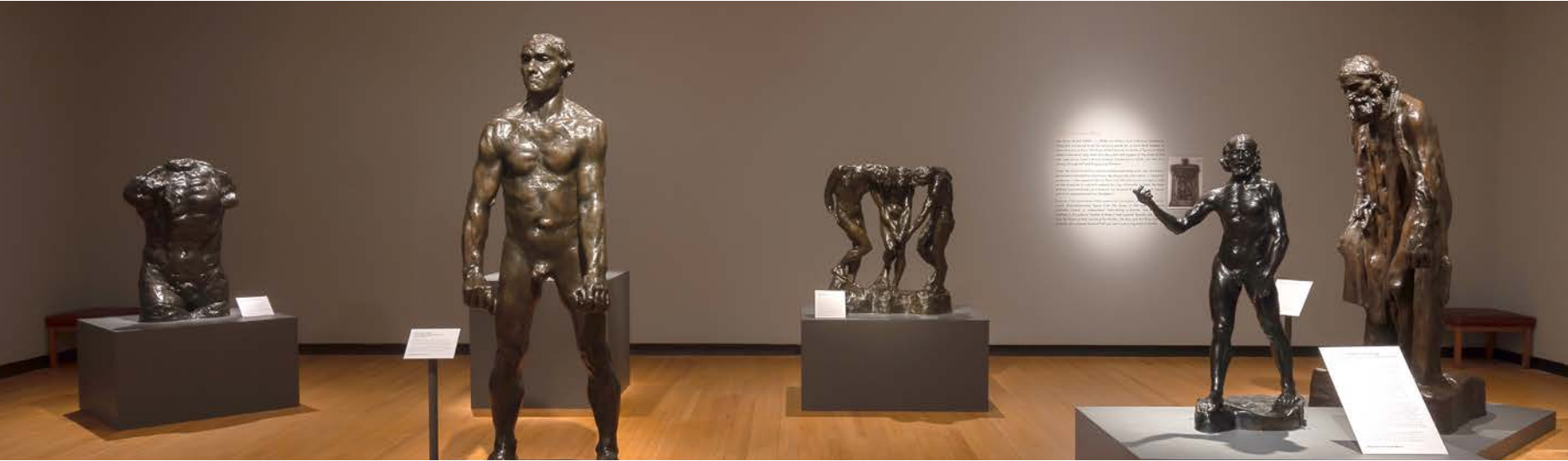
(from left to right) ‘Monumental Torso of The Walking Man,’ ‘Jean D’Aire, Nude,’ ‘Three Shades,’ ‘Saint John the Baptist Preaching,’ ‘Eustache de St. Pierre, Vetu.’

An artist of the Post-Impressionist era (roughly the last two decades of the nineteenth century), Rodin is not easily categorized. His focus on “real” human forms behaving in “real” human ways echoes the strengths of the French Realists and Impressionists, who focused similarly on the world and people of the here and now — and how we actually see them. Meanwhile, the unmitigated expressive emotion of Rodin’s figures, such that they make viewers actually feel something themselves recalls the expressionistic manners of fellow Post-Impressionist-era artists including Vincent Van Gogh. But, whereas those artists are celebrated principally for their two-dimensional work, Rodin injects into the arena of sculpture all the humanity and emotion of the real world with a touch and style uniquely his own.